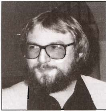
Warren Norwood (1983)

Norwood began writing as a poet, but transitioned to fiction in the early '80s. He wrote a number of SF and fantasy novels, beginning with space opera The Windhover Tapes: An Image of Voices (1982). Other books in that series are Flexing the Warp (1983), Fize of the Gabriel Ratchets (1983), and Planet of Flowers (1984). His Double Spiral War trilogy includes Midway Between (1984), Polar Fleet (1985), and Final Command (1986). His standalone books are post-holocaust SF Shudderchild (1987) and Mayan-flavored fantasy True Jaguar (1988). He also wrote three Time Police novels, the last two with Mel Odom: Vanished (1989), Trapped! (1989), and Stranded (1989). He was a finalist for the John W. Campbell Award for Best New Writer in 1983 and 1984.